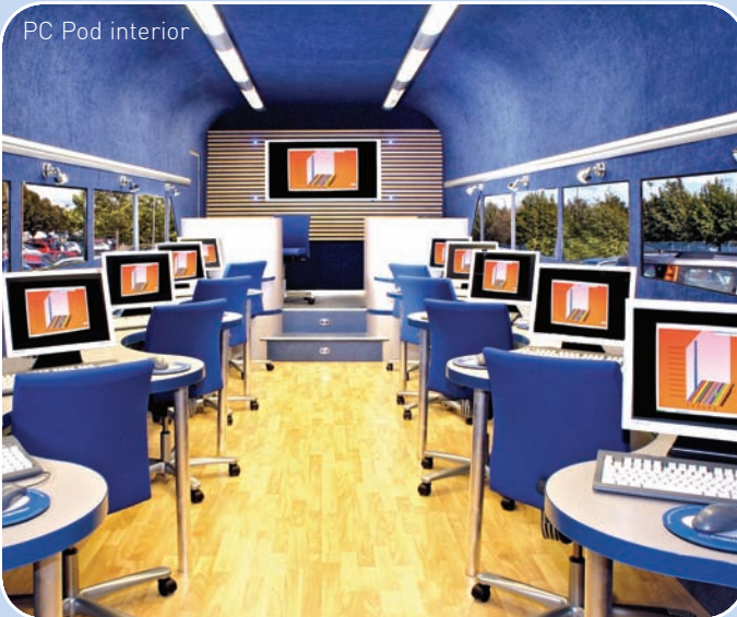
PC Pod interior

The daily rate includes all the essential technical support to configure the onboard IT to your specific requirements with the vital back-up to deliver and set up each unit on-site.