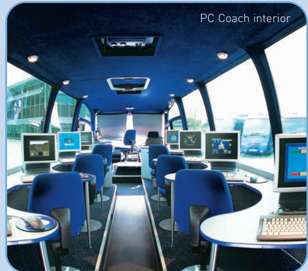
PC Coach interior

If you haven't been aboard one of our units, call us to arrange a demonstration or to receive our rate card, case studies and technical data. We are also only too happy to put you in touch with our clients to hear firsthand how they have benefited by working with us.